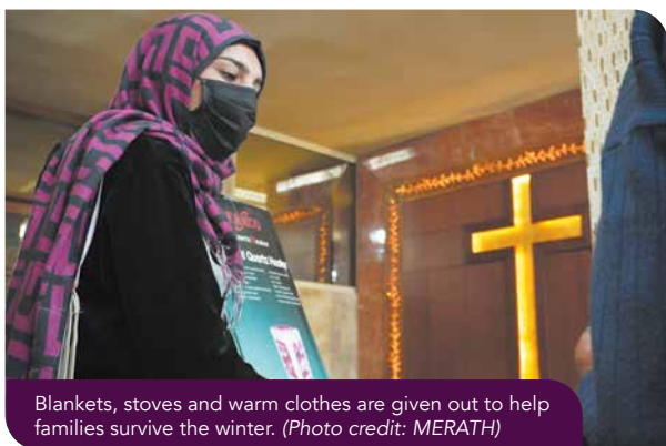
Blankets, stoves and warm clothes are given out to help families survive the winter.

We pray for refugees across Lebanon, which has the highest number of refugees per capita in the world. Many do not have any formal refugee camps to go to and live in inadequate shelters. Our partner MERATH will be responding to winter needs again this year distributing warm clothes, blankets and mattresses to help them survive the winter ahead.