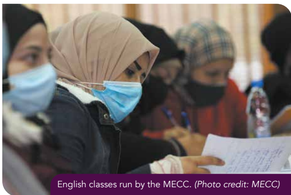
English classes run by the MECC.

Lebanon's financial crisis and the pandemic have had a devastating impact on families who were already struggling. We pray for the Middle East Council of Churches as they help women overcome isolation and improve their employment prospects by providing training classes.