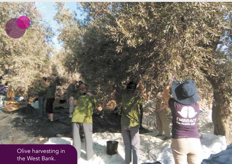
Olive harvesting in the West Bank.

economically and symbolically, yet thousands have been uprooted or burnt by Israeli settlers. By assisting with the harvest, our volunteers show solidarity with the farmers. We keep them in our prayers this week.